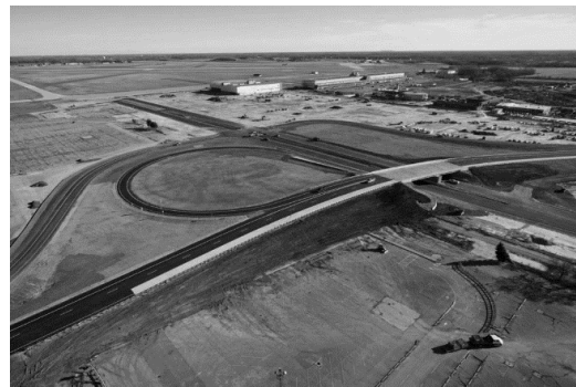
b. American Center for Mobility