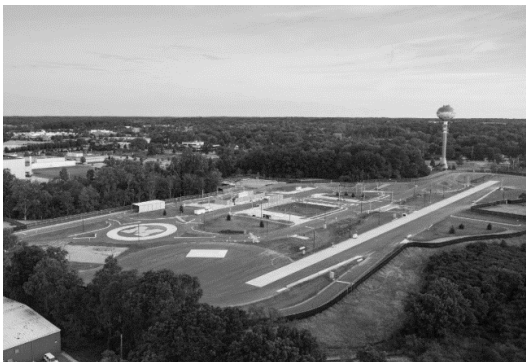
a. Mcity is a 32-acre simulated urban and suburban environment