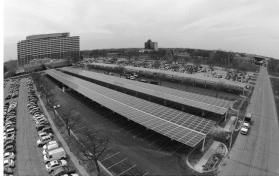
Figure 3. Ford World Headquarters in Dearborn MI