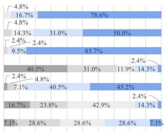
0% 10% 20% 30% 40% 50% 60% 70% 80% 90% 100% Strongly disagree Somewhat disagree Neither agree nor disagree Somewhat agree Strongly agree

Q13. My performance in the class would have been about the same with or without the instructional videos.