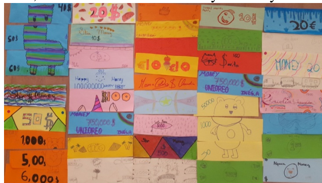
Image 3. Sample – Thank You Coupons, designed by the 6th Graders in the American School of Las Palmas, Spain. The picture shows how creative were the individual "artists". The reason for saying thank you is written on the back side of each "banknote", this way it remains always there, a nice memory from each other.

This module provides an opportunity to learn monitoring and better-expressing emotions. The Coupon itself is designed individually, and any creative self-expression is welcomed. The value does not count; the only rule is to name three classmates or teachers, find three activities and say "thank you."