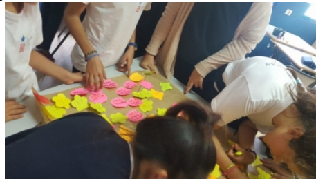
Image 1. Collaborating girls create the Passion Tree. The American School of Las Palmas, 2018

How do we realize it? They create a tree together, and hang on "flowers" or "leaves," introduce their passion, share the experience when and where they utilized, developed this passion. The "Passion Tree" is actualized every week, ensuring that "B+ Math Students" have the same weekly opportunity to be seen passionate, may demonstrate a keen interest and successful delivery of something important. The proper attention is given to each, regardless of the grades or the economic background of the family.