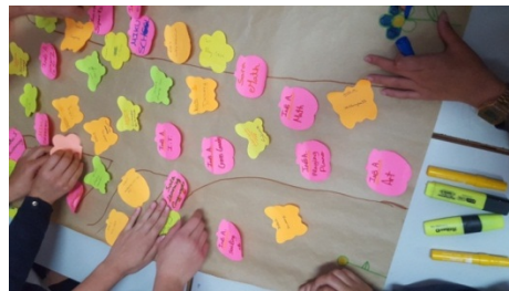
Image 2. The hands show that the creation of the Passion Tree was a real cooperation. The American School of Las Palmas, 2018

Observations: The communication was enriched. They revealed previously unknown details about each other. The self-esteem of every participant was strengthened, and the communications skills were developed week-by-week. In the beginning, they seemed to be very shy. Naming three things that they love doing or are passionate about was not an easy task. It took some weeks for the children to gain routine, and become confident at these conversations. The concept of giving attention to others was better and better understood as time went by. Children received immediate feedback. They were inspired by the care received. The creation of the tree and the flowers involved creativity, arts, and crafts. All the "passion flowers" were collected in individual folders, and a great feedback-book was created from them, witnessing the personal development and passion.