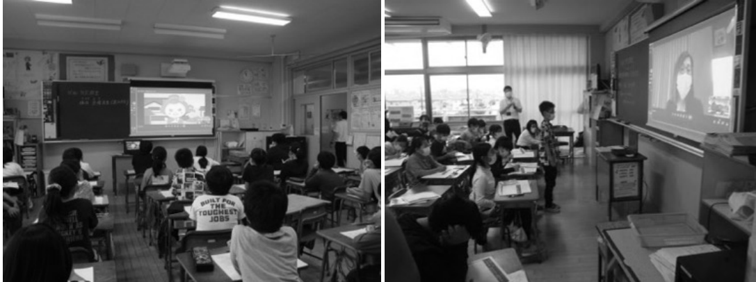
Figure 4: The scene of practice in Study 3

There were one hundred forty-eight 4th grade students (4 classes) and 10 special treated students (2 classes). Each class had one teacher.