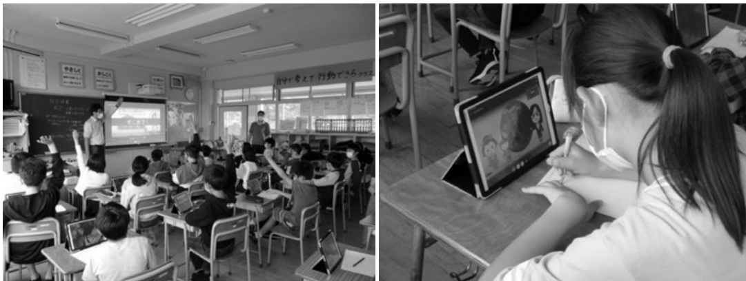
Figure 3: The scene of practice in Study 2

There were twenty-eight fourth grade students (one class). Class had two teachers (i.e., a classroom teacher and the vice principal). Twenty-seven students participated from the classroom and one student from the nurse's room, because the student had difficulty in participating in the classroom. In Japan, this approach is allowed for children with some challenges (MEXT, 2011).