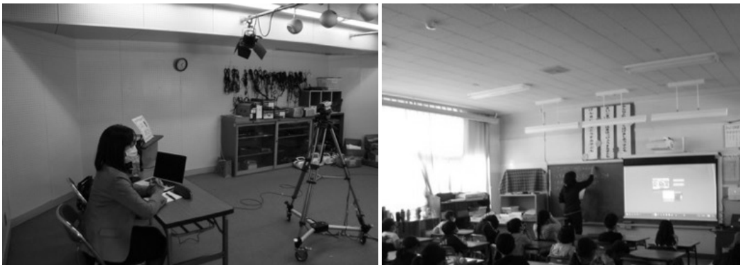
Figure 2: The scene of practice in Study 1

There were eighty-one 4th grade students, one-hundred ten 5th grade students, and one-hundred twelve 6th grade students (3 classes per grade). Each class had one teacher.