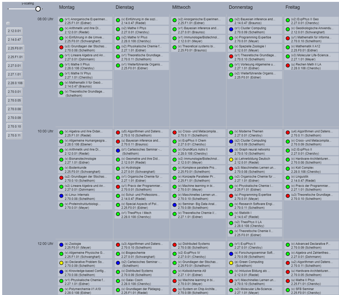
Figure 2: Part of the resulting timetable containing about 200 course components at the Faculty of Science for summer term 2024. Green indicates lectures, red exercises, blue seminars and yellow projects.