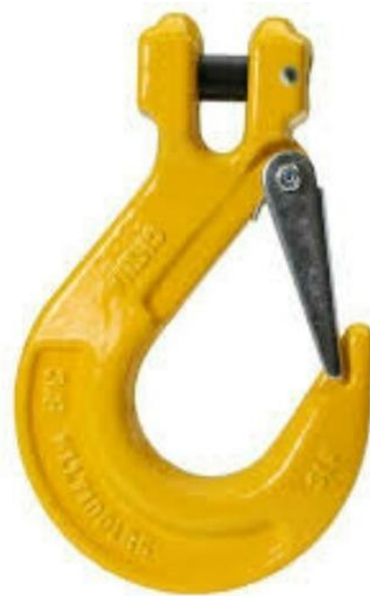
Fig, crane hook

traditional in both cases traditional specimen live longer, long durability, service factor as factor of safety 10. Most of the engine components parts factor of safety is considered for design as 10. The crane will lift maximum capacity beyond predicted value. Suppose designed allowable tonne capacity if he mention 2tonne , definitely it will lift 2.5 tonne also with safety proper work load