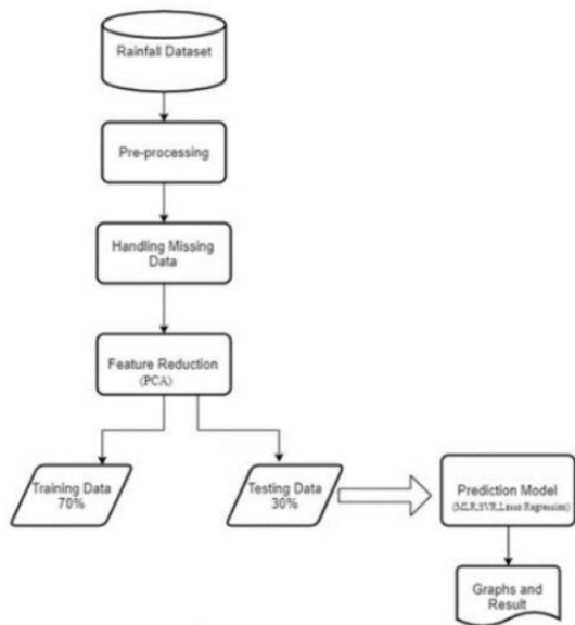
Fig. 1. System Architecture