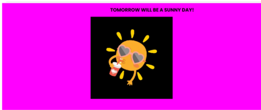
Fig. 4. action of gesture control