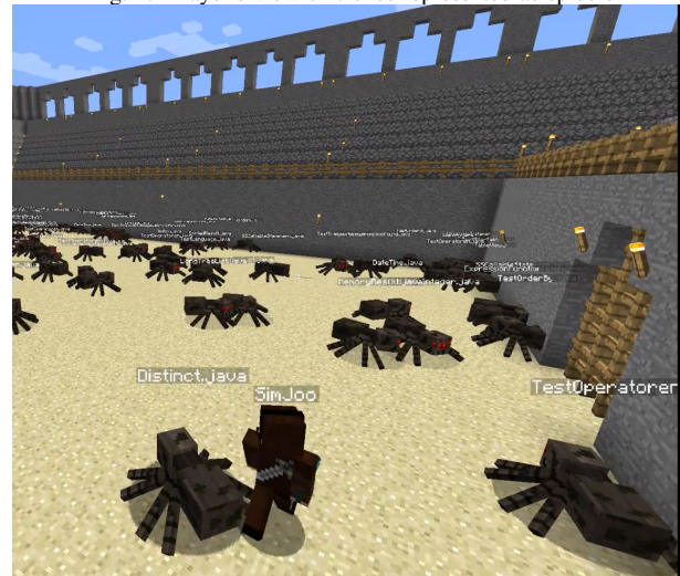
Fig. 1. Player's view of clones represented as spiders

The Java project to be improved can be chosen from disk, or a GitHub URL can be specified to download a project from. After the project has been chosen, the tool will create a monster for each code issue found. The user will have to fix code issues in order to collect experience points.