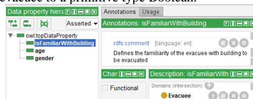
Fig. 4. Datatype properties in Protégé

Datatype properties relate an individual of a class to a primitive value [16]. In Fig. 4, we show the example of the property isFamiliarWithBuilding , which relates an individual of the class Evacuee to a primitive type Boolean.