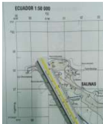
Fig. 4. Topographic Map, which is used to measure distances through scales.

The measuring instruments used for this study were: topographical map, chronometers (CASIO), GPS (GARMIN Etrex), meteorological measuring equipment (VAISALA), which are illustrated in Fig. 4, Fig. 5, Fig. 6 and Fig. 7.