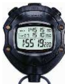
Fig. 7. A Casio chronometer