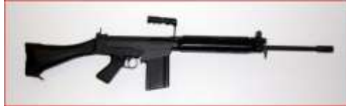
Fig. 1. FAL Rifle used during military training

The FAL rifle is a Belgian battle weapon, it is chambered for the 7.62×51mm NATO cartridge. The word FAL comes from the French acronym “Fusil Automatique Léger” which is translated in English as Light Automatic Rifle [1]. It is illustrated in Fig. 1, and it is used during the military training at the Air Force Academy.