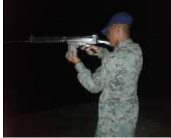
Fig. 3. Each student had 8 attempts.

The speed of light ( c ) is faster in a vacuum which is equivalent to: