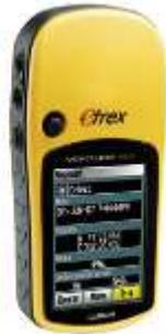
Fig. 5. GPS, it was used to measure distances.