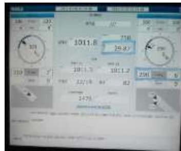
Fig. 6. Instrument applied to determine meteorological conditions, in this case, the temperature.