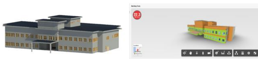
Figure 1. Modelling of Sipitang District Police Headquarters, Sabah

Modelling analysis is done in this study to help create utilisation strategy for 6D BIM implementation in Malaysia. Revit 2021 and Autodesk Insight 360 were used to create 6D building information model of Sipitang District Police Headquarters, Sabah as shown in figure 1.