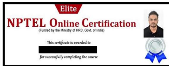
Fig. 2 Participants clear the online exam based on the e-module