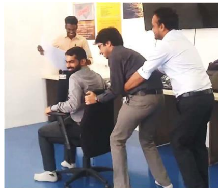
Fig. 3 Participants form teams and enact from users' perspective the various problems given to the other teams to solve