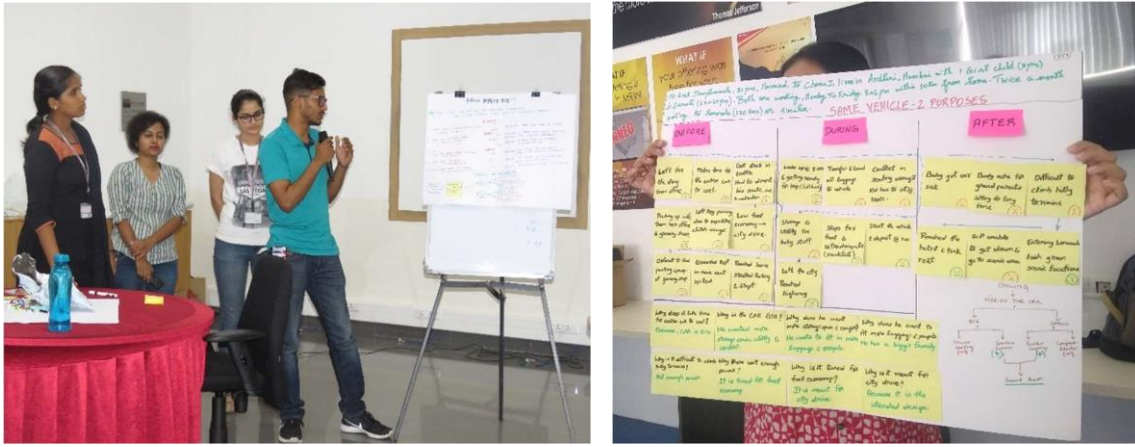
Fig. 5 Teams present their analysis based on various insights